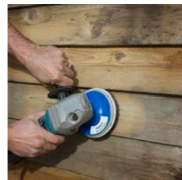
Buffy Pad System

1 Remove old stain or unsound wood fibers