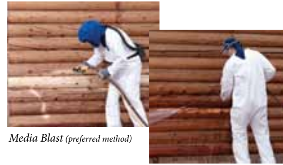
Media Blast (preferred method)

Osborn® is a trademark of Osborn International.